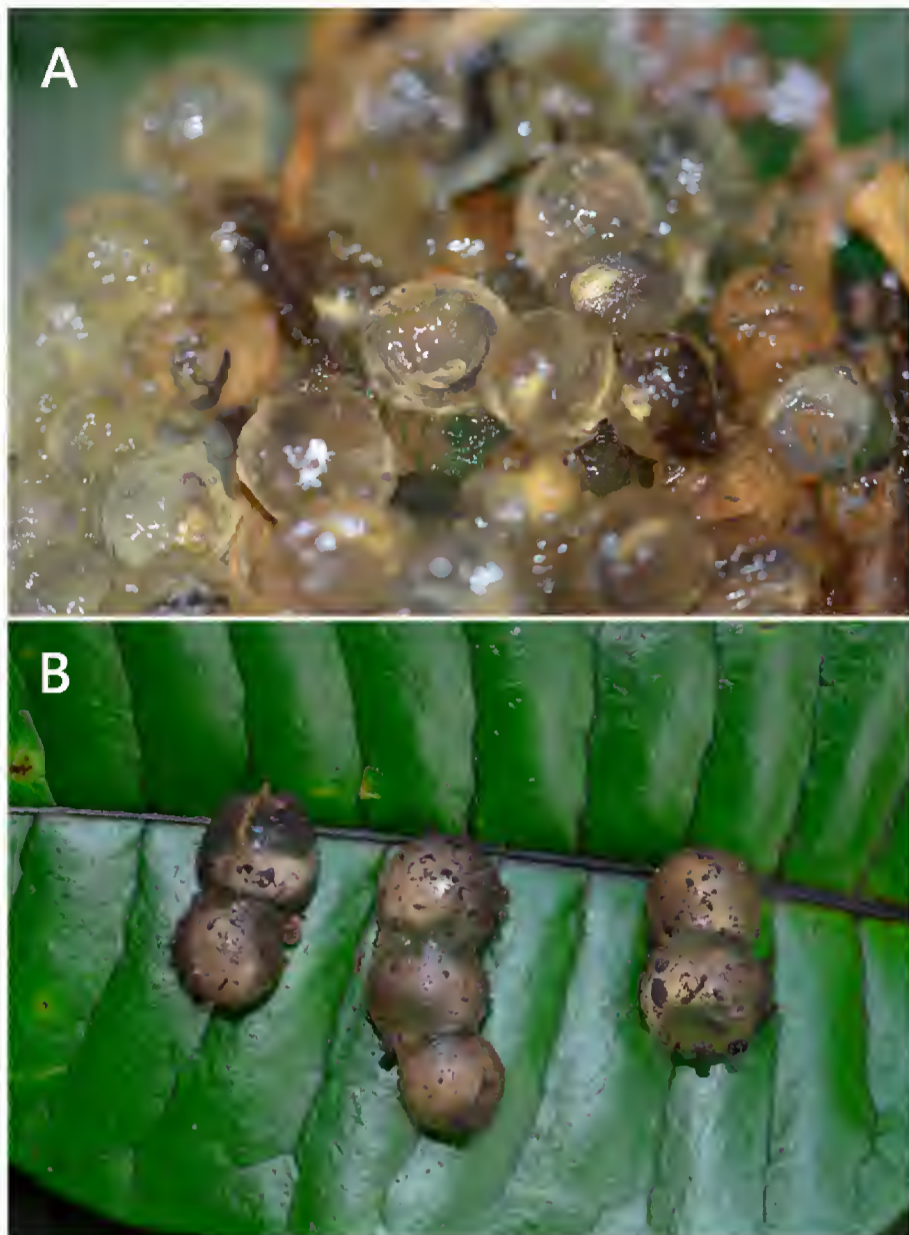
Fig. 3. A: Typical clutch of Tylototriton ziegleri composed by single eggs; B: an exceptional case of “stickiness” where eggs were aggregated in groups of 2–4.

and 1,369 m above sea level. Tylototriton vietnamensis was found between 181 and 512 m above sea level in Bac Giang and Quang Ninh provinces, and between 840 and 980 m above sea level in Lang Son Province. Spawning sites consisted of small ponds for both species, although in the district Quan Ba, Ha Giang Province we also found clutches of T. ziegleri in the slopes of a slow flowing forest stream, suggesting that this species can also breed in this type of habitat. A physical evaluation of ponds during our field work showed that the ones inhabited by T. ziegleri were significantly deeper ( F_{1,42} = 25.11 , P < 0.001 ; mean 79 \pm 58 cm, n = 19 , range between 10 and 200 cm) than those inhabited by T. vietnamensis (mean 25 \pm 14 cm, n = 81 , range between 3 and 60 cm), while the area was roughly the same ( F_{1,44} = 0.004 , P = 0.95 ; T. ziegleri : mean 84 \pm 165 m 2 , range between 2.5 and 510 m 2 ; T. vietnamensis : mean 82 \pm 102 m 2 , range between one and 460 m 2 ). Most adults (61% of 82 individuals of T. ziegleri and 72.2% of 255 individuals of T. vietnamensis ) were found in breeding sites with 50% or more canopy cover, although still 34.1% of all T. ziegleri and 12.2% of all T. vietnamensis were found in breeding sites with no canopy cover (Fig. 2).